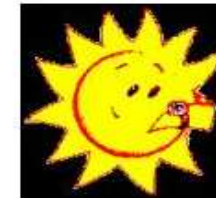
Sonne und Freiheit