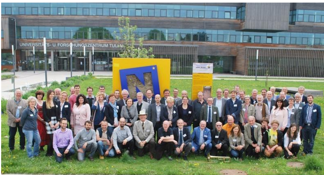
Participants and organisers of the 24th Conference of the Working Group Sustainability in front of the UFT Tulln, A

Working Group Sustainability, Energy and Environment focusing on soil protection & sustainable land use