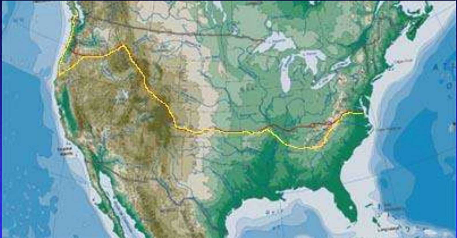
Trans-USA Bicycle Path