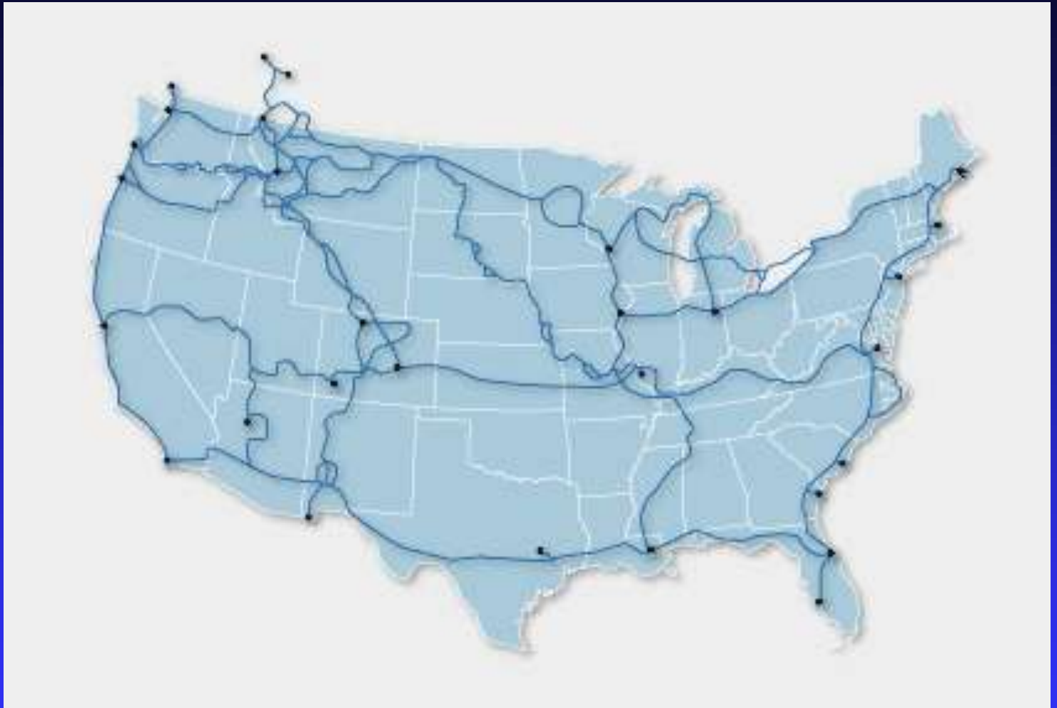
Adventure Cycling Route Network